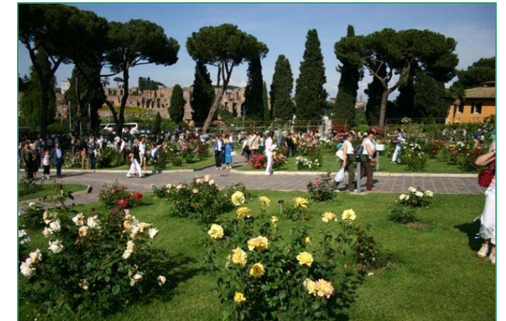
Garden of Roses in Rome (pictures taken in May 2006)