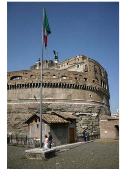
Castel Sant'Angelo In Rome