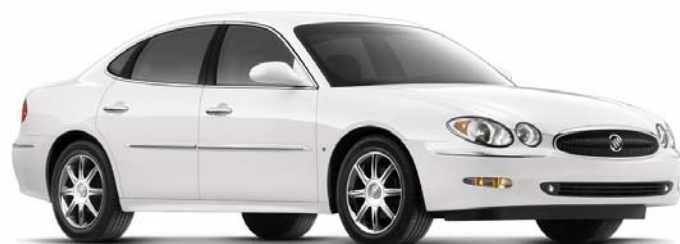
Automobile courtesy of Patsy Lou Williamson

Grand Prize 2006 Buick LaCrosse 4 Door Air Powered Lumbar 6-Passenger Seating 2800 V6 Engine 16" Aluminum Wheels