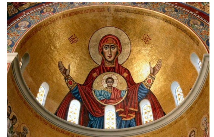
St Paul's Melkite Church Harissa - Lebanon (May 2006)