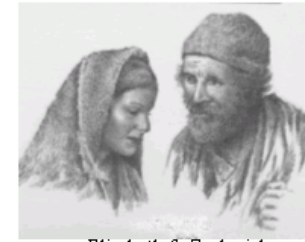
Elizabeth & Zechariah

Zechariah and his wife Elizabeth were both godly people, always observing all the Lord's commandments. He was a priest and Elizabeth was a descendent of Aaron (a priestly line.)