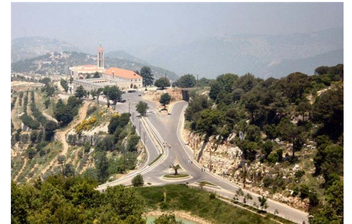
St Maron's Monastery where the tomb of St Sharbel is located. Annaya - Lebanon (May 2006)