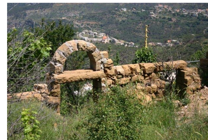
Ruins of an old house. Haitoora - Lebanon (Picture taken in May 2006)