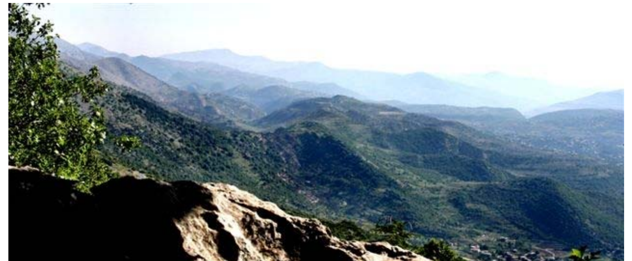
Mountains of Lebanon.

From Maaser El-Shouf - Lebanon (May 2006)