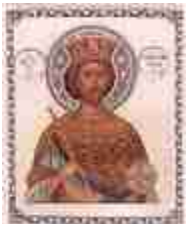
ST. CONSTANTINE THE GREAT FEAST DAY: MAY 21

St. Constantine was born in 272, the Son of Constantius Chlorus (the ruler of the westernmost parts of the Roman Empire), and of the blessed Helen. In 306, when his father died, he was proclaimed successor to his throne. In 312, on learning that Maxentius and Maximinus had joined forces against him, he marched into Italy, where, while at the head of his troops, he saw a radiant pillar in the form of a cross with the words: "By this shalt thou conquer." The following night, our Lord Jesus Christ appeared to him in a dream and declared to him the power of the Cross. When he arose in the morning, he immediately ordered that a banner be made in the form of a cross, and he inscribed on it the Name of Jesus Christ. On the 28th Of October, he attacked and conquered Maxentius, who drowned in the Tiber River while fleeing. The following day, Constantine entered Rome in triumph and was proclaimed Emperor of the West by the Senate, while Licinius, his brother-in-law, ruled in the East. Out of malice, Licinius persecuted the Christians. Constantine fought him and in 324 utterly destroyed him. In this manner he became monarch over the West and the East. Under him and because of him all the persecutions against the Church ceased. Christianity triumphed and idolatry was overthrown.