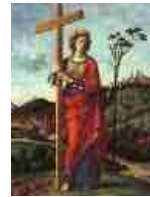
ST. HELEN MOTHER OF ST. CONSTANTINE FEAST DAY: MAY 21

St. Constantine was born in 272, the Son of Constantius Chlorus (the ruler of the westernmost parts of the Roman Empire), and of the blessed Helen. In 306, when his father died, he was proclaimed successor to his throne. In 312, on learning that Maxentius and Maximinus had joined forces against him, he marched into Italy, where, while at the head of his troops, he saw a radiant pillar in the form of a cross with the words: "By this shalt thou conquer." The following night, our Lord Jesus Christ appeared to him in a dream and declared to him the power of the Cross. When he arose in the morning, he immediately ordered that a banner be made in the form of a cross, and he inscribed on it the Name of Jesus Christ. On the 28th Of October, he attacked and conquered Maxentius, who drowned in the Tiber River while fleeing. The following day, Constantine entered Rome in triumph and was proclaimed Emperor of the West by the Senate, while Licinius, his brother-in-law, ruled in the East. Out of malice, Licinius persecuted the Christians. Constantine fought him and in 324 utterly destroyed him. In this manner he became monarch over the West and the East. Under him and because of him all the persecutions against the Church ceased. Christianity triumphed and idolatry was overthrown.